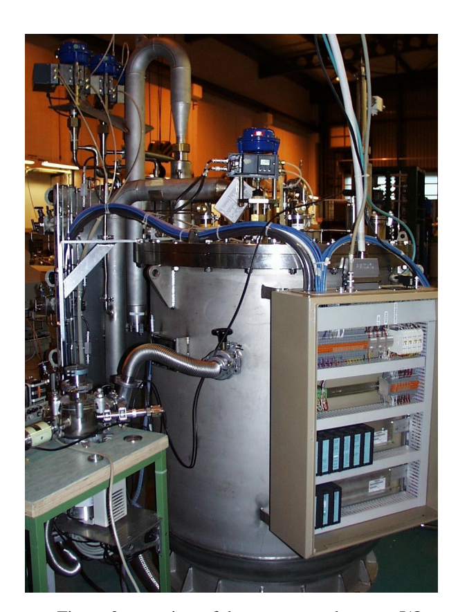
Figure 2: overview of the cryostat and remote I/O

Differential pressure transmitters (from ABB) measure the pressure drop along the resistive part of the leads. Absolute pressure transmitters (from ABB) are used to control the pressure of the helium baths and to monitor the He recovery line.